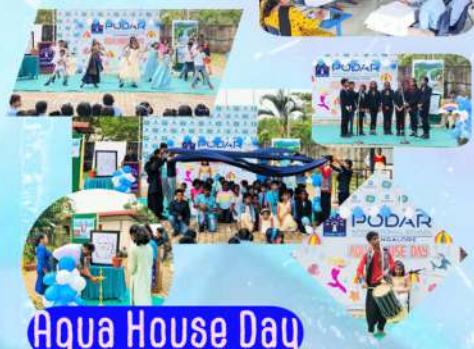
Aqua House Day