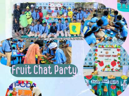
Fruit Chat Party