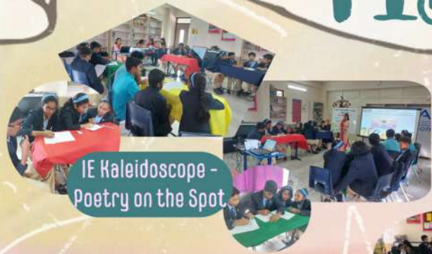
IE Kaleidoscope - Poetry on the Spot