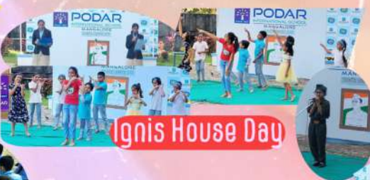
Ignis House Day