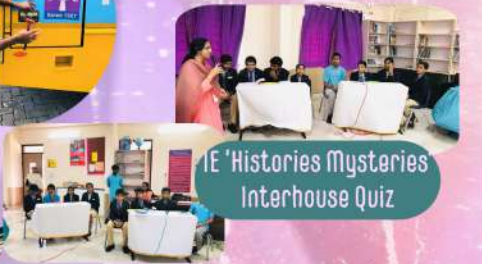
IE 'Histories Mysteries Interhouse Quiz