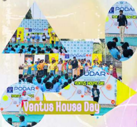
Ventus House Day