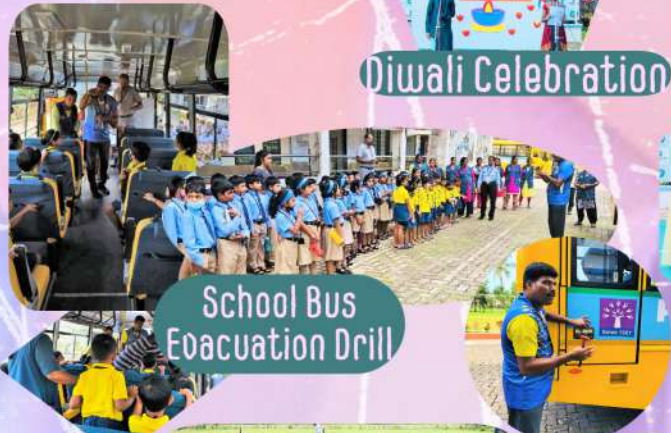
School Bus Evacuation Drill