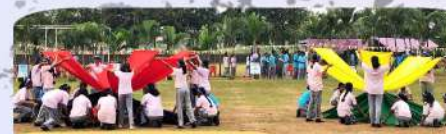
Udaan-22 Senior Girls Sari Drills Display