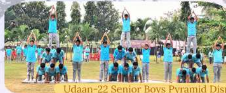
Udaan-22 Senior Boys Pyramid Display