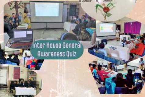
Inter House General Awareness Quiz